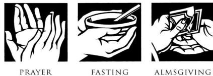
PRAYER FASTING ALMSGIVING